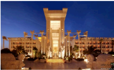
Kadoos Hotel in Rasht