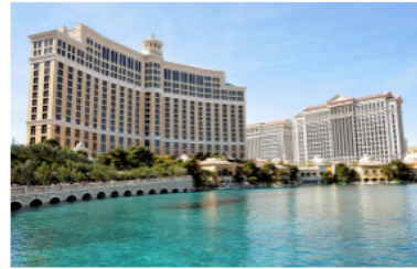
Mont Carlo Hotel in Las Vegas with 3.200 rooms