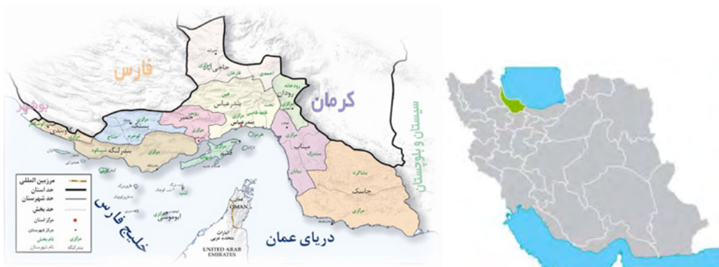
Figure 1. The location of Bandar Abbas city in Hormozgan province and Iran

The weather in Bandar Abbas city (southern beach) includes a high humid weather, high temperature, sea breeze to the dry area and the local winds. (figure 1)